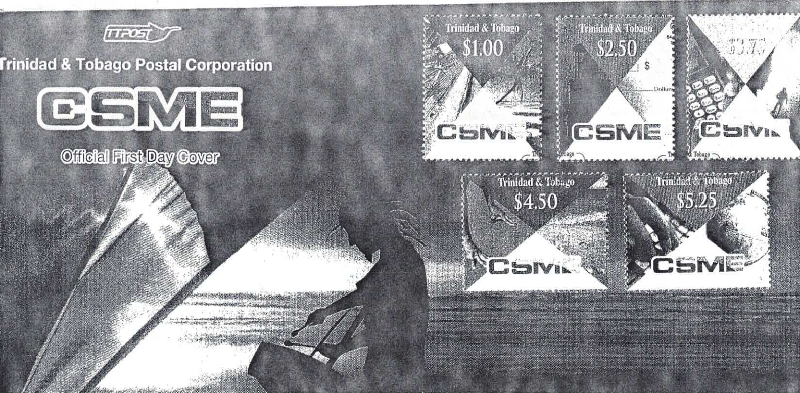
Fig. 1: THE CARIBBEAN SINGLE MARKET AND ECONOMY FDC

The second issue released for this year was the Caribbean Single Market and Economy (CSME) on the 3rd July. The issue consisted of five stamps: $ 1 - Oil drilling equipment and beach scene; $ 2.50 - Lighthouse and cheque; $ 3.75 - Cell (mobile) telephone and diver; $ 4.50 - Athlete hands on track and beach scene; $ 5.25 - Computer keyboard and globe. A souvenir sheet was produced with a single $ 15 stamp in it illustrating Seashells, Reef fish, Sand dollar and Coconut trees.