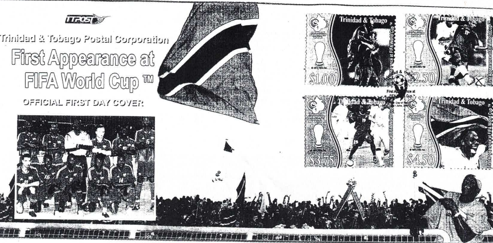
Fig. 2: FOOTBALL - FIRST APPEARANCE AT FIFA WORLD CUP FDC

The issue was printed by Thomas Greg & Sons de Colombia S.A. The artwork and graphics were done by Troy Rhodes of DesignWise. The FDC's were sold at $ 19.00 each and the Souvenir Sheets at $ 15.00 each.