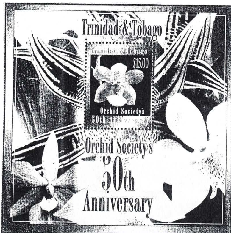
FIG. 6: T&T's ORCHID SOCIETY'S 50th ANNIVERSARY SOUVENIR SHEET

sub-humid areas. It is caused primarily by human activities and climatic variations. The cachet bears the logos of TTPost, Ministry of Public Utilities and the Environment, United Nations and International Year of Deserts and Desertification 2006. The covers bear the 30c stamp of the 1983 Flower Definitive. The covers were sold at $ 7.00 each and a brochure was included.