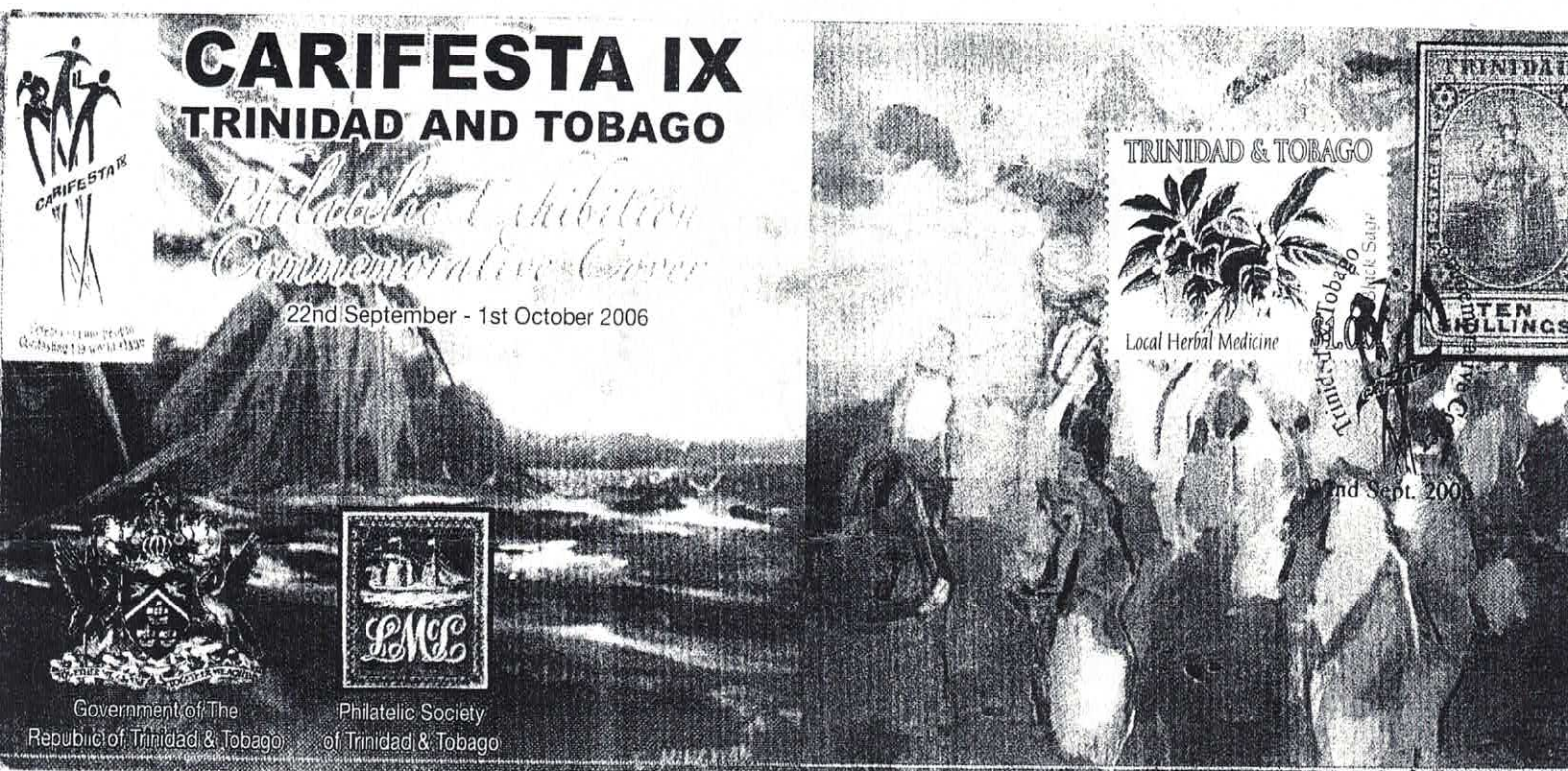
FIG.7: CARIFESTA IX PHILATELIC EXHIBITION COMMEMORATIVE COVER

The aerogrammes were printed by Media Sales Limited of Maraval. A quantity of 15,000 each were produced. The aerogrammes may not be reprinted after this production run is sold out as new designs are being planned.