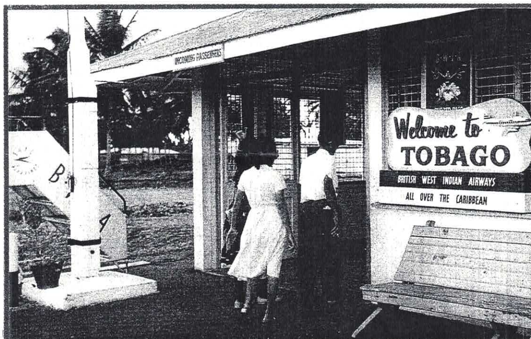
Fig.2: PICTURE POSTCARD OF TOBAGO AIRPORT TERMINAL - INCOMING PASSENGERS