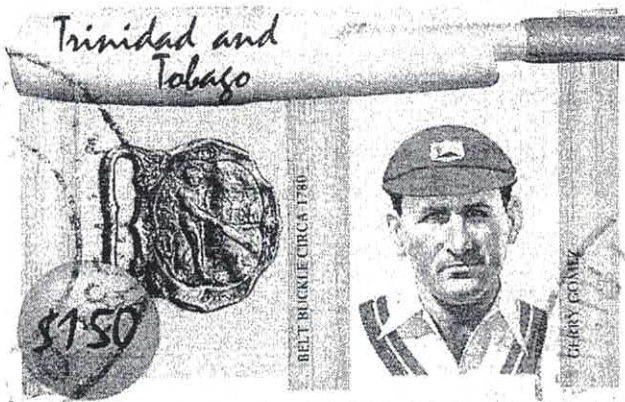
Figure 2: $1.50 stamp from the 1988 Famous West Indian Cricketers series honouring Gerry Gomez.

Gerry Gomez was featured on the $1.50 stamp of the Famous West Indian Cricketers series of 1988 (SG 739, Scott 474 - shown in Fig 2).