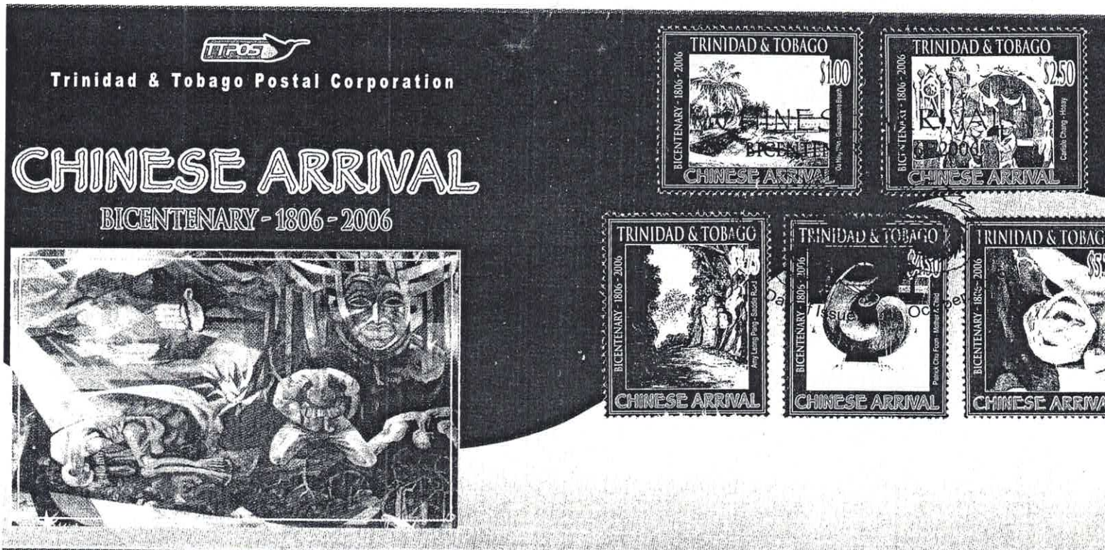
FIG. 1: CHINESE ARRIVAL BICENTENARY 1806 - 2006