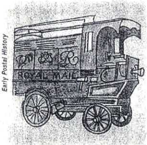
First Day Issue

The Lady McLeod was featured on a Montserrat stamp released on 31st July 2008. The subject of the Montserrat issue was early postal history and it consisted of a souvenir sheet containing six stamps - all $ 2.75 denominations. Five of the stamps had illustrations of Montserrat and British postal history. The top left stamp illustrated the Lady McLeod and stated: ' First Caribbean Stamp / The Lady McLeod '. The Lady McLeod stamp made T&T the first country in the British Empire (Commonwealth) to issue a stamp after Great Britain. Albert Sydney brought the above issue to our attention.