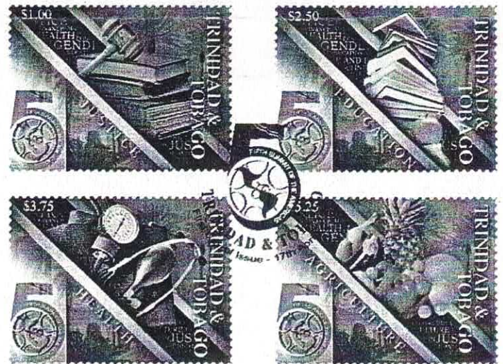
FIG.1: FIFTH SUMMIT OF THE AMERICAS FDC (PROPOSED)

The Fifth Summit of the Americas was held in Port of Spain from the 17th to 19th April 2009. Thirty-four Heads of State and Government from the North, Central and South Americas and the Caribbean attended. A stamp issue was proposed and printed to commemorate this Summit, however, at the last moment, it was decided not to issue it. This decision was made by high authorities (not TTPOST). The reason is believed to be that the designs of stamps did not reflect the objectives of the Summit. This is important as this issue would be scrutinized by all of the Heads of State and the Press Corps from all the countries participating.