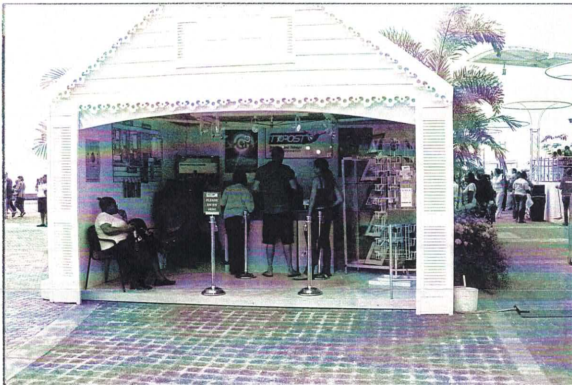
FIG.2: TTPOST POST OFFICE BOOTH AT THE SUMMIT OF THE AMERICAS

The image of the FDC was downloaded from the TTPost web-site where it was posted for several weeks. The proposed issue consisted of four stamps: $ 1.00 - Justice - gavel and law books; $ 2.50 - Education - school books; $ 3.75 - Health - medical equipment; $ 5.25 - Agriculture - various fruits.