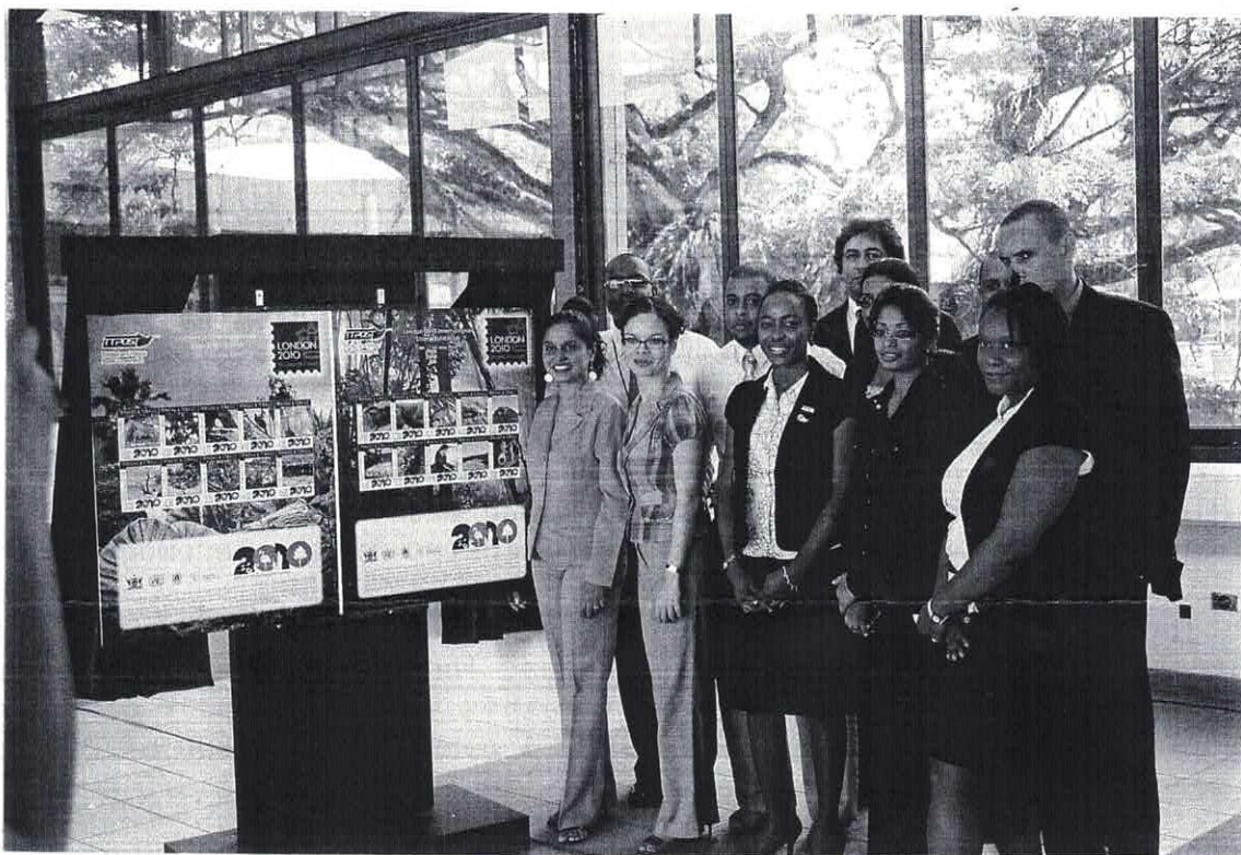
Fig.3: BIODIVERSITY LAUNCH - STAFF OF THE EMA AT THE CEREMONY

inches by 6 1/4 inches (278mm X 157mm). The FDC's were sold at $ 25.00 each and the Souvenir Sheets at $ 20.00 each. The printing quantities produced were 500 FDC's and 3000 S/S's. A brochure was produced for this issue.