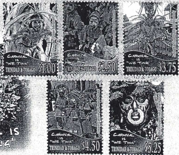
Fig.3: 'CARNIVAL IS WE TING' FDC