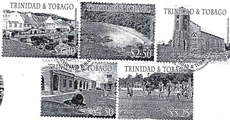
FIG.1: 30th ANNIVERSARY TOBAGO HOUSE OF ASSEMBLY FDC

30th Anniversary of the Tobago House of Assembly