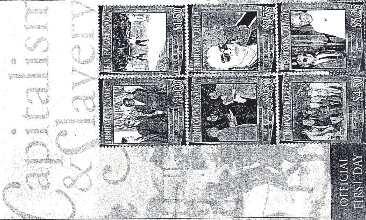
Fig. 4: CENTENARY OF THE BIRTH OF DR. ERIC WILLIAMS FDC (TURNED SIDEWAYS)

TTPost Trinidad & Tobago Postal Corporation CENTENARY OF THE BIRTH OF DR. ERIC WILLIAMS 1911 - 2011