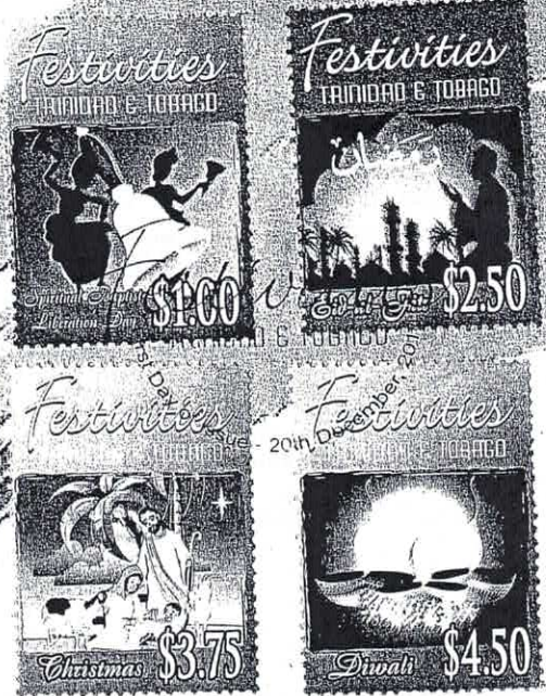
Fig.2: FESTIVITIES FDC