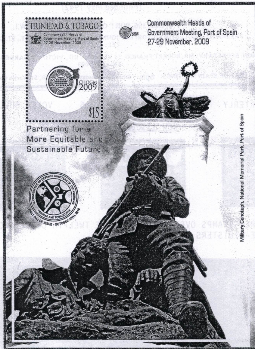
FIG.3: THE SOUVENIR SHEET WITHOUT OVERPRINT AND WITH FDOI CANCELLATION

The third issue of 2016 consisted of three overprinted stamps to commemorate the Twelfth Conference of Defence Ministers of the Americas held in Port of Spain 10th to 12th October. The three stamps of the 2002 Forts issue - $3.75, $4.50 and $5.75 (SG #933-35/Sc #647-49) - were all overprinted '$1.00 TWELFTH CONFERENCE OF THE DEFENCE MINISTERS OF THE AMERICAS' (Fig.1). The stamps were issued on the 10th October.