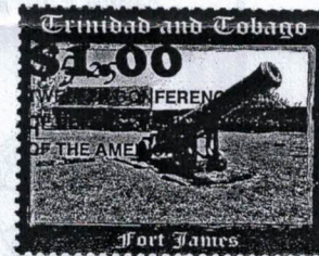
FIG.1: THE THREE STAMPS OVERPRINTED FOR THE TWELFTH CONFERENCE OF DEFENCE MINISTERS OF THE AMERICAS