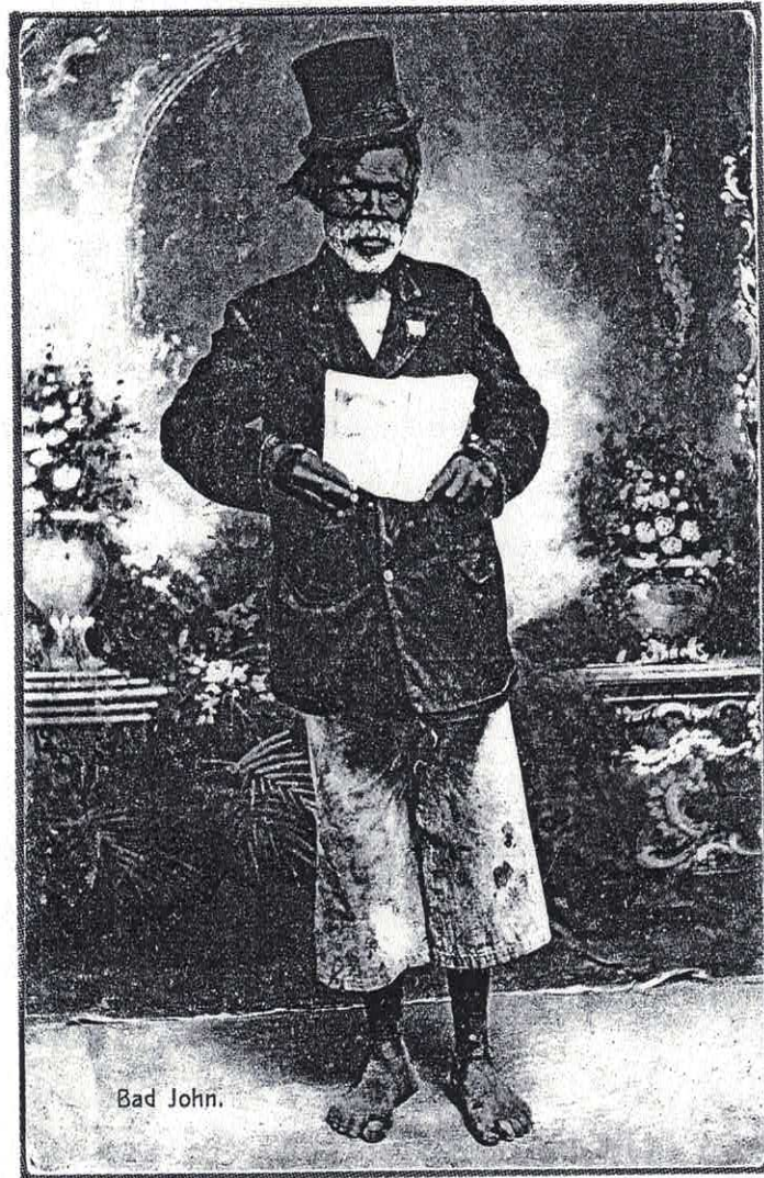
BAD JOHN (circa 1846-1916)